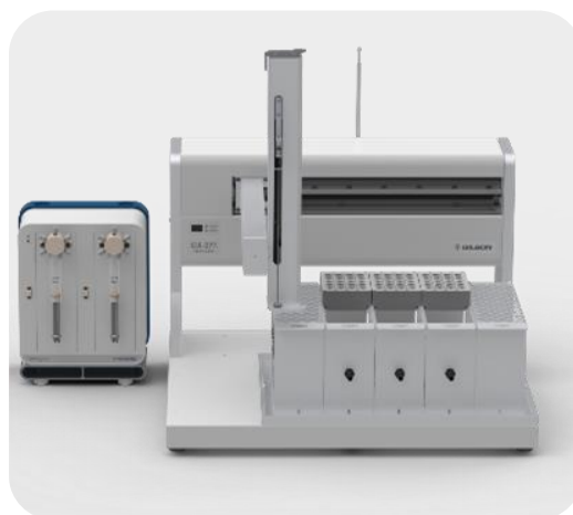
Figure 1. Gilson GX-271 ASPEC System shown with VERITY 4260 Dual Syringe Pump (Part no. 2614008)

This study describes an automated SPE protocol using a Gilson GX-271 ASPEC™ system (Figure 1) for the simultaneous extraction of amphetamines, cocaine and its metabolites (benzoylecgonine, ecgonine methyl ester) and opiates as well as a variety of benzodiazepines prior to analysis by LC/MS-MS.